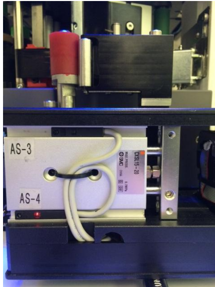
Figure 6. This is the other sensor tripped when the roller is closed. If there are no obstructions and the LED is not lit it needs to be adjusted.