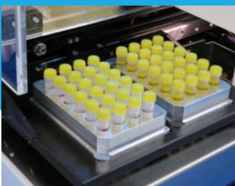
Deck plate holds 2 SBS racks or Scinomix can custom manufacture rack adapters to fit user's racks

At Scinomix, our mission is to provide walk-away time with innovative automation solutions. Scinomix is pleased to offer one of the most unique lines of automated labeling systems aiding in the advancement of pharmaceutical biotech and genomic research.