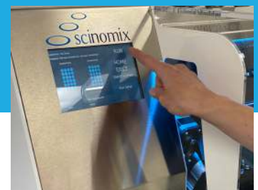
User-friendly touchscreen software allows for quick and easy setup