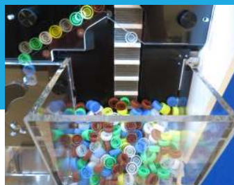
Cap hopper holds up to 1,000 2 ml cryovials (dependent on cap size)