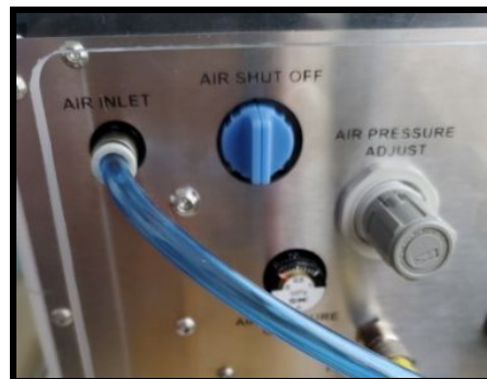
Figure 1. Air Shut Off switch