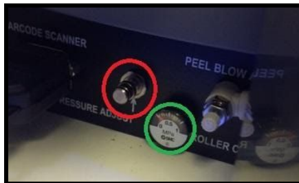
Figure 5. Roller Pressure Adjust Screw and Gauge

NOTE: The gauge should read 0.3 MPa if caps are not being added, and 0.5 MPa if caps are being added.