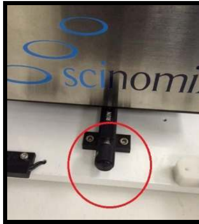
Figure 2. Run selector