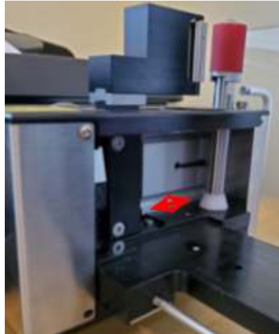
Figure 4. Area to check for tubes