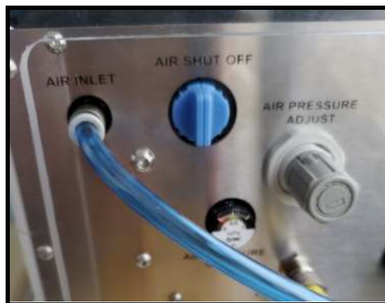
Figure 1. Blue Air Shut Off switch