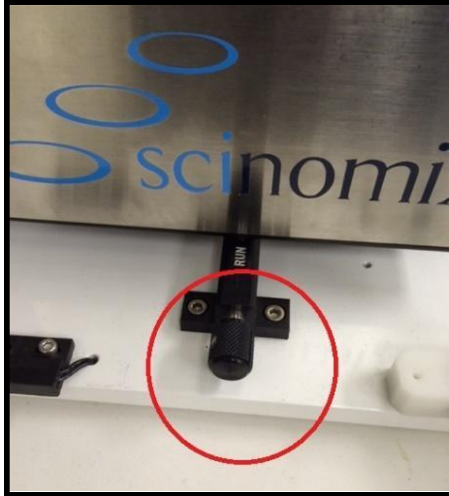
Figure 2. Run selector