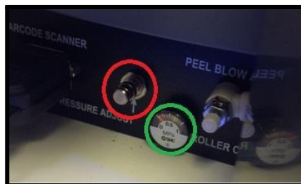
Figure 5. Roller Pressure Adjust Screw and Gauge

NOTE: The gauge should read 0.3 MPa if caps are not applied, and 0.5 MPa if caps are applied.